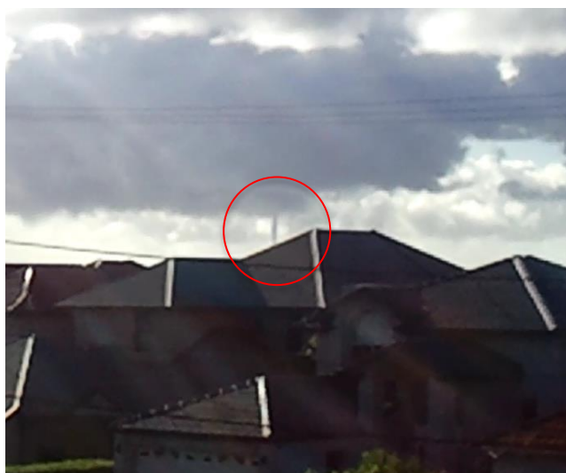
Figure 1: Fair weather waterspout sighted by first author off the coast of North Curl Curl, Sydney (2013).

Fair-weather waterspouts are intense low pressure vortex columns that most frequently develop on the sea surface lasting from two to twenty minutes. The funnels occur most frequently in the tropics and sub-tropics where heated, humid air creates strong convective currents. These are regularly sighted off the Australian coastline, usually dissipate at sea and cause little damage if reaching shore (less than EF0 on the Enhanced Fujita scale), Figure 1.