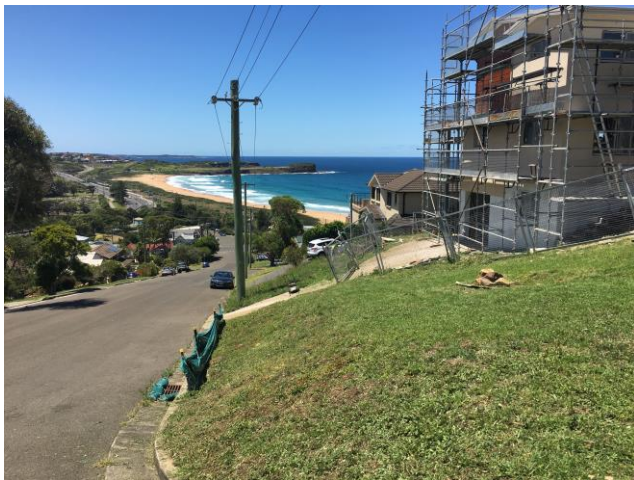
Figure 7: Hothersal Street, Kiama photo taken January 2016.

Property damage at Kiama was similar to that in the Kurnell and Lennox Head events, based on media reports and verbal discussions with Kiama residents by the first author. Figure 7 illustrates a home re-build still in construction almost three years after the event. The waterspout was reported to have come off the ocean causing damage to properties on the hill crest (camera location) before continuing south then inland toward Jamberoo.