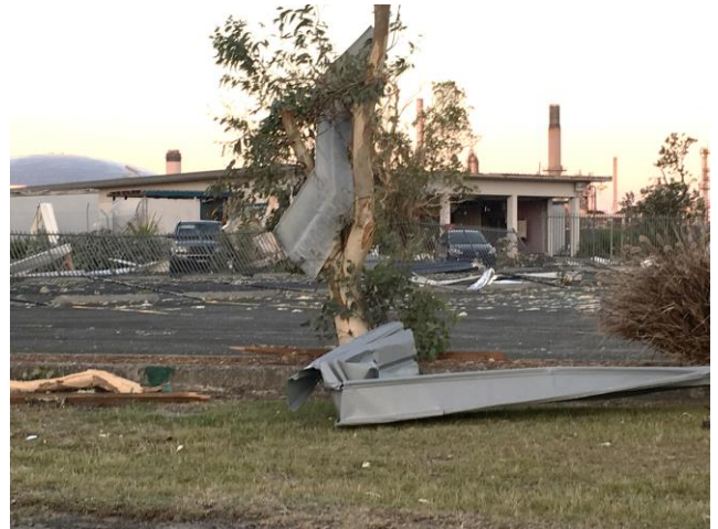
Figure 4: Debris from the desalination plant and other surrounding buildings on Sir Joseph Banks Drive, Kurnell.

The tornado passed directly over the residential township of Kurnell northward to Botany Bay, Figure 6. Inspecting damage in the residential zone was reminiscent of surveying water spout damage in Lennox Head 2010, with damage confined to a finite width outside of which little permanent damage could be observed. Roof damage was common to homes in the damage swathe, with lifted roof sheeting, and missing tiles, and removed solar panels.