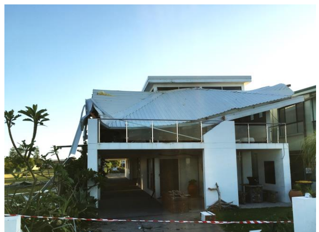
Figure 6: Damage to a residential home in the Kurnell township.

Temporary structures were also displaced (e.g. garden sheds, awnings, a trampoline and fallen trees). A video of the swathe was captured by a drone flight (see DailyMail 2015 weblink )