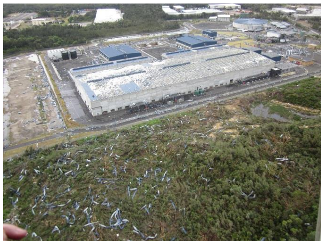
Figure 3: Debris from the desalination plant and its surrounding buildings captured by the Westpac Lifesaver Rescue Helicopter.

Much of Sir Joseph Banks Drive was littered with debris from this and other buildings (Figures 4).