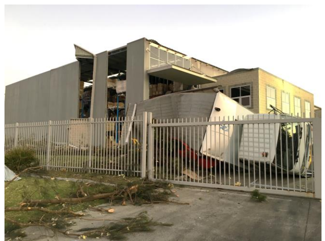
Figure 5 Damage to industrial building on Chisholm Road, Kurnell, with overturned truck in foreground.